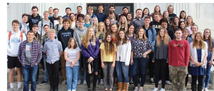
Senior Class of 2018

BRANDT CENTER Northwest Nazarene University